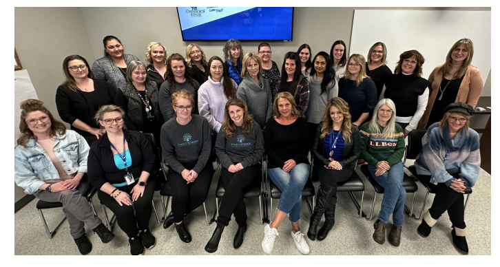
CESD Family School Wellness team

During the 2022/23 school year there have been more than 11,000 individual sessions with students and a Chinook's Edge Family School Wellness (FSW) Worker. That's about 10% more than last year, and this year is not yet complete.